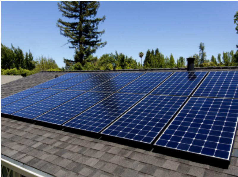
Sample of tile installed on your neighbor's house!